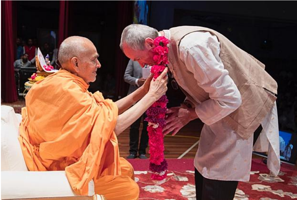
A 2017 visit to the Robbinsville mandir

Instead, the complaint said, they were severely exploited and forced to do manual labor while living in trailers inside a fenced, guarded compound.